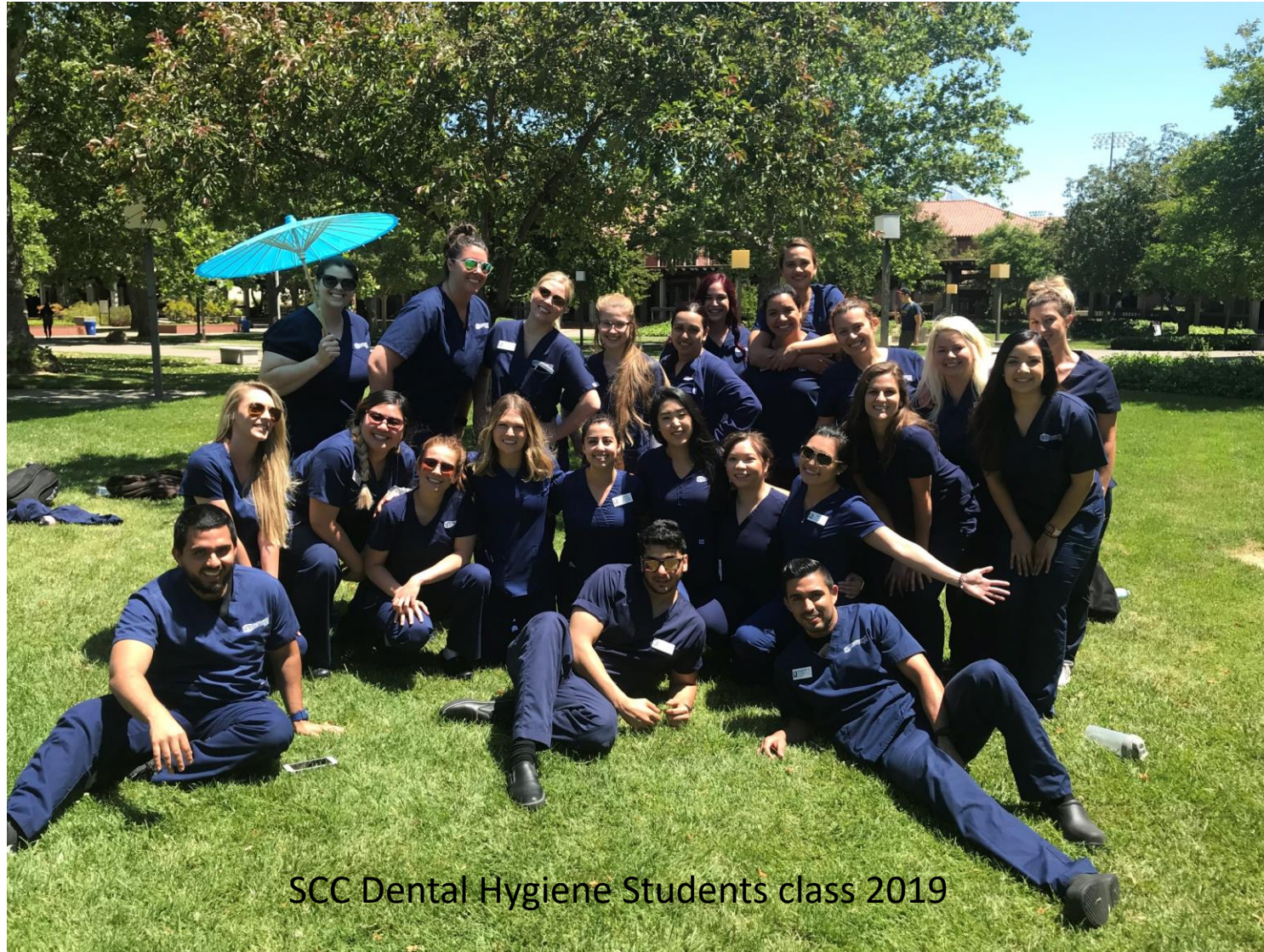
SCC Dental Hygiene Students class 2019